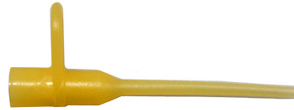
Nozzle for "salami" 1211001.000