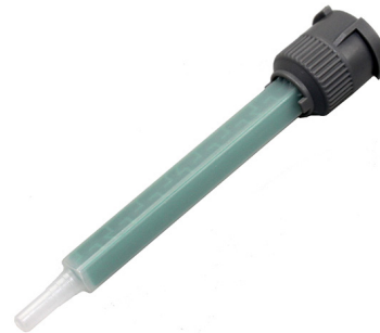
Mixing set with nozzle 1212666.300