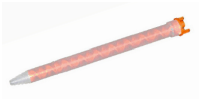
Mixer for MA/2k 25 and 50 ml 1242015.001