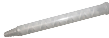
Mixer for 225/2K 13x18, for 490 ml cartridges 1212225.901