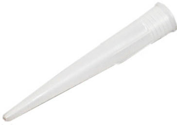
LINOP DT tip 1242015.021